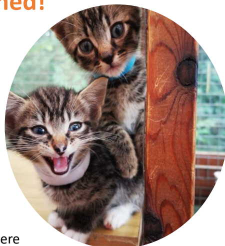
Conifer & Oak in foster care

Concerned about re-homing the kitten with the lame front leg appropriately, we returned him to our Vet for a further check where we received good news that that no further action was required as he was now racing around his foster home with no sign of lameness! Having received lots of applications for the kittens, we were soon able to match this kitten to a home, where he has a companion in another young cat and is doing well.