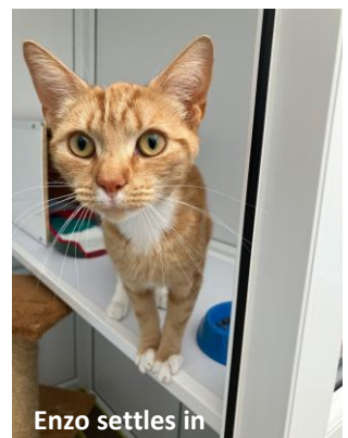
Enzo settles in

After a long search and one year on from the sad closure of Five Acres Cattery in Guildford, we now have a new partner cattery located on the Surrey/Hampshire border (for reasons of safety and security, we will not share the exact location). We have a separate entrance and exclusive access to three pens, one that has space for four cats and two others that can each accommodate two. Opaque panels separate the pens so that the cats being cared for are not able to see into each other's pens, thereby minimising stress levels.