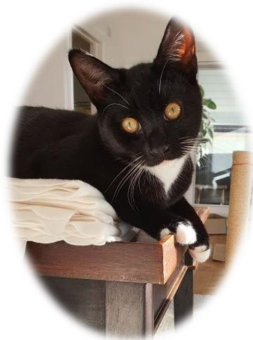
Tux enjoying life in his new home

His new owner tells us that friendly Tux has settled quickly into his new home in closeby Hersham, really enjoys his new-found company and is loving life!